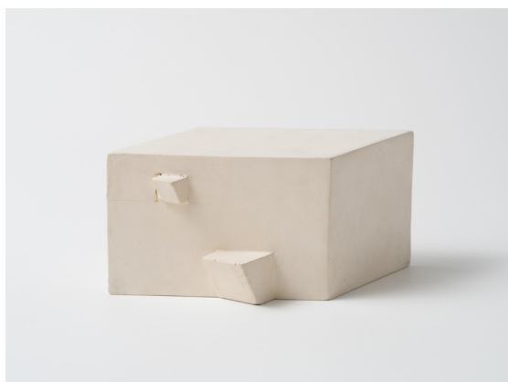
Sergio Camargo (1930 – 1990) Untitled, 1970 Painted wood relief 12 x 18 x 11 cm [4 3/4 x 7 x 4 1/4 in.]